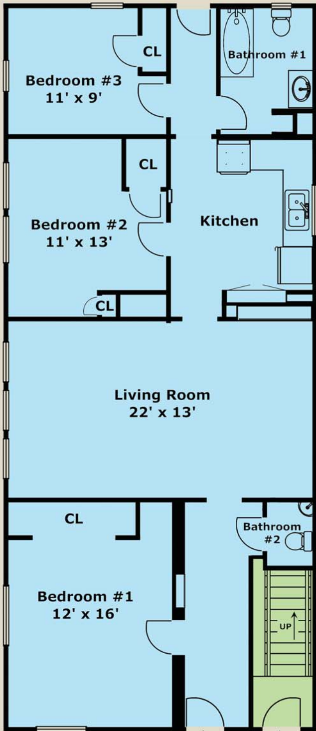
Main Entry 3143 Telegraph (Lower Level)