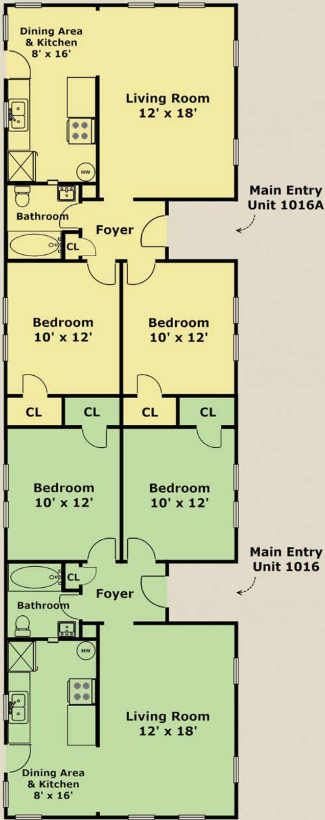
1016 Buena Vista Ave